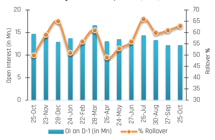
Nifty Rollover Comparison (MoM)