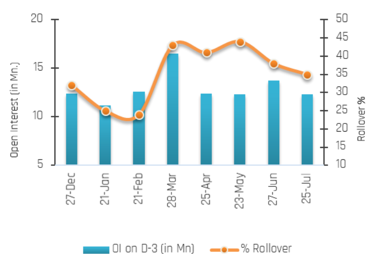
Nifty Rollover Comparison (MoM)