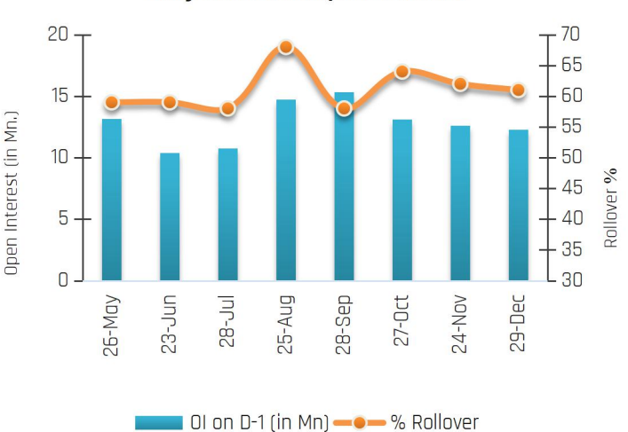
Nifty Rollover Comparison (MoM)