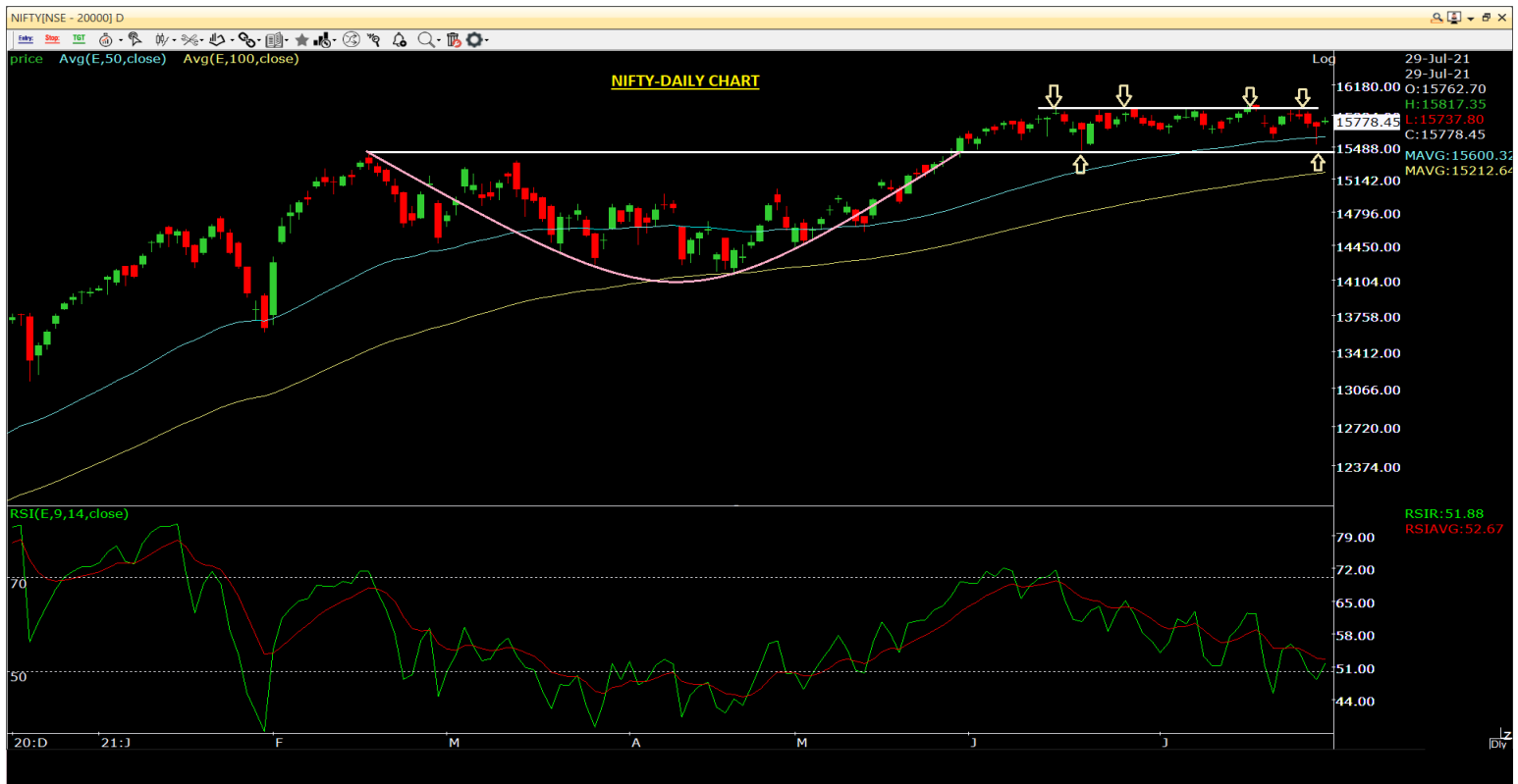
NIFTY 50 - 29-JULY 2021 DAILY CHART