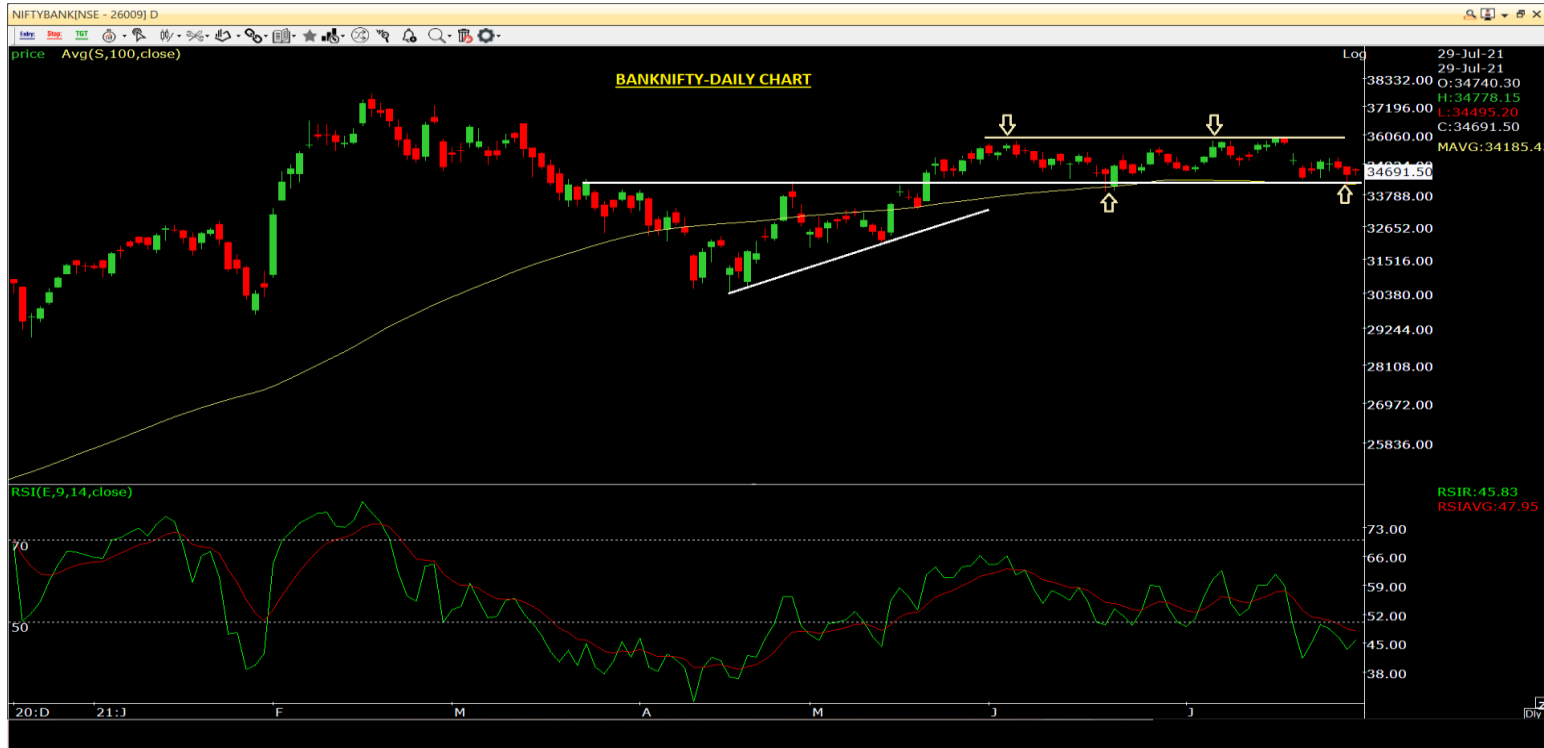
BankNifty- Daily Chart