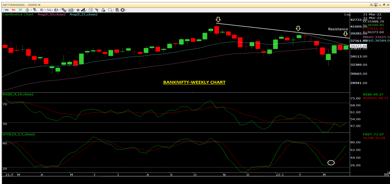
BankNifty- Weekly Chart