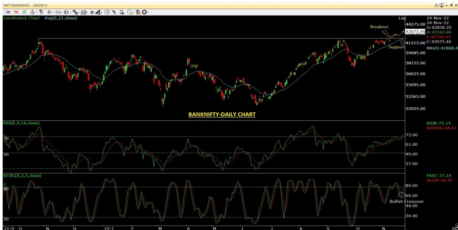
BankNifty- Daily Chart